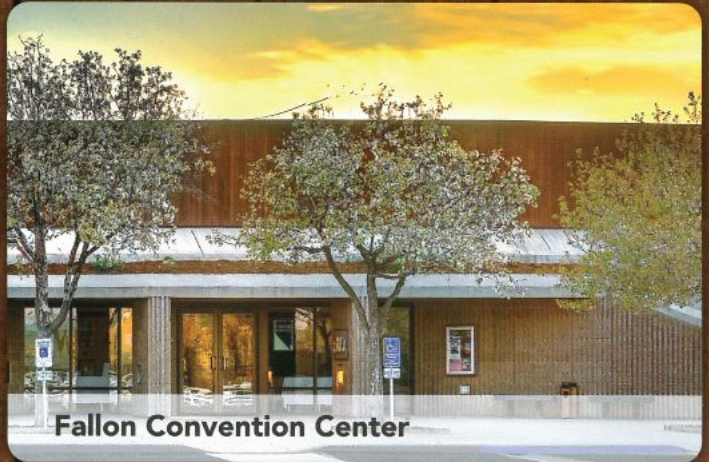
Fallon Convention Center